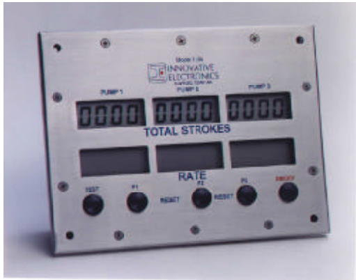
Three Pump Mechanical Switch Input Cable 125' P/N 95EA03C5