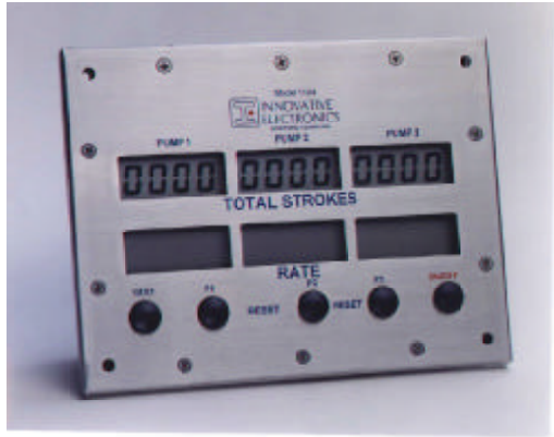
Three Pump Mechanical Switch Input Cable 125' P/N 95EA03C5